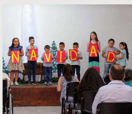
the children from church telling the true meaning of Christmas