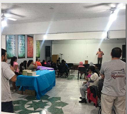
Evangelistic event on March 14th- Gospel presentation amidst health exams and free school supply giveaway