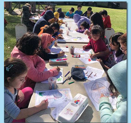
Children's class at the Easter retreat