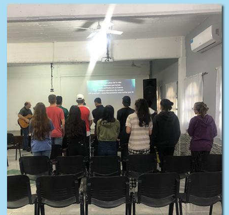
Praise time in our youth group.